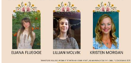
LADIES GUILD SCHOLARSHIP RECIPIENTS